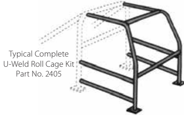
Typical Complete U-Weld Roll Cage Kit Part No. 2405

Bolt-In Cross Brace Option ..... Part No. 2408 ..... $109.99 Replaces the welded braces included with roll bar; can be removed when not racing to allow use of the back seat.