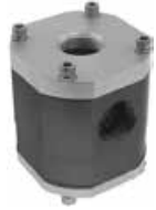
Right: Mounting Clamp for Billet Filters Part No. 1281-003