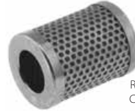
Replacement Short Canton Oil Element Part No. 1291