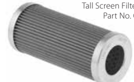
Tall Screen Filter Element Part No. CM 26-150

Protect your expensive dry sump pump! Install one of these screen elements in a Canton remote-mounted oil filter (above left) for a free-flowing scavenge filter. The coarse 400 mesh allows free flow, yet catches the larger debris (40 micron and larger) that can destroy dry sump pumps. These elements are not for use for final oil filtration. The Short element fits the 4" remote-mount housing. The Tall element fits the 6" remote-mount housing. Sold individually.