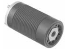
Right: 6.25" Filter Part No. 1284

Remote Mount Canton Oil Filters These filters have very strong yet lightweight machined aluminum housings. The inlet in one end cap and the outlet in the side are both -12 O-ring ports for reliable, leak-free connections. We stock adapter kits separately to convert these O-ring ports to a variety of male AN sizes. The 4-bolt housings are easily disassembled to replace the filter element or to inspect for signs of engine damage. The billet aluminum housings are blue anodized with clear anodized end caps. A standard 8 micron filter element is included.