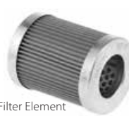
Short Screen Filter Element Part No. CM 26-050